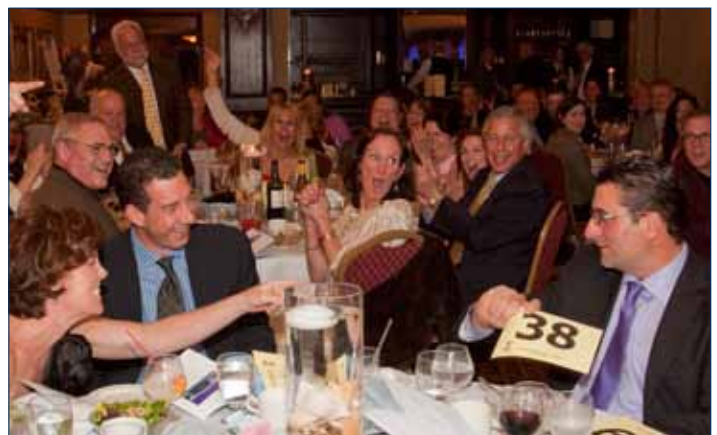
Parents enjoy themselves during the auction portion of Celebration By the Bay.